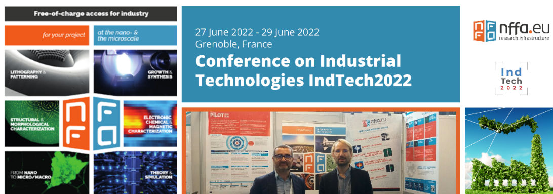
Figure 4: LinkedIn post: portfolio of techniques