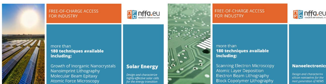
Figure 2: LinkedIn post: Study case 1

Here are the following pictures that were used and were designed by the NFFA business developer in collaboration with Promoscience.